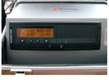
Fig. 1. View of certificated vehicles unit - digital tachograph