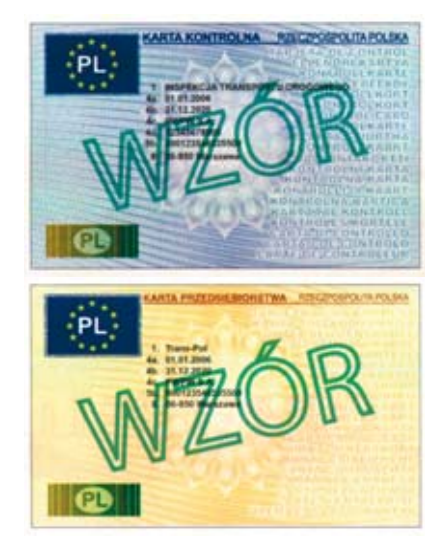
Fig. 2. View of cards in digital tachographs system in Poland